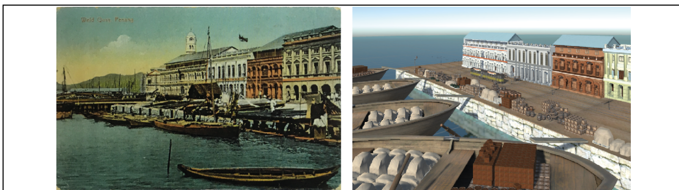
Figure 1. Realism of the Scene Using Digital Technology

Digital cultural heritage (DCH) is a fairly new field of study, sharing and inheriting the objectives of traditional cultural heritage within the purpose of preserving the past and raising the possibilities of public awareness and understanding. DCH is also known as Virtual Heritage when it comes to three-dimensional (3D) synthetic recreation of real environments. The production of DCH aims to enhance or substitute of a real historical sites or objects as well as significant cultural elements through current digital technologies [7]. In short, the traditional way of preserving the cultural heritage can be substituted or enhanced with the current digital technologies. An example of digitally simulating the historical site has shown in Figure 1.