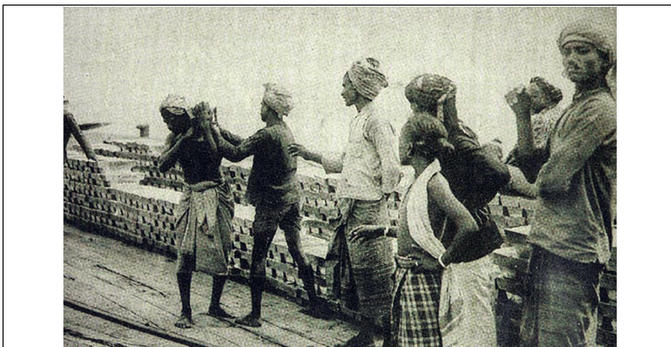
Figure 3. Apparel and activities happened at Weld Quay in the early of twentieth century.

As shown in figure 2 and 3 are photos and postcards regarding people, activities and environment setting of Weld Quay in the early of twentieth century. One can safely assure that these settings are more unlikely to exist nowadays as they are considered as fragile assets. Therefore, they are more likely to be preserved using visualization and simulation by exploiting advanced digital technology.