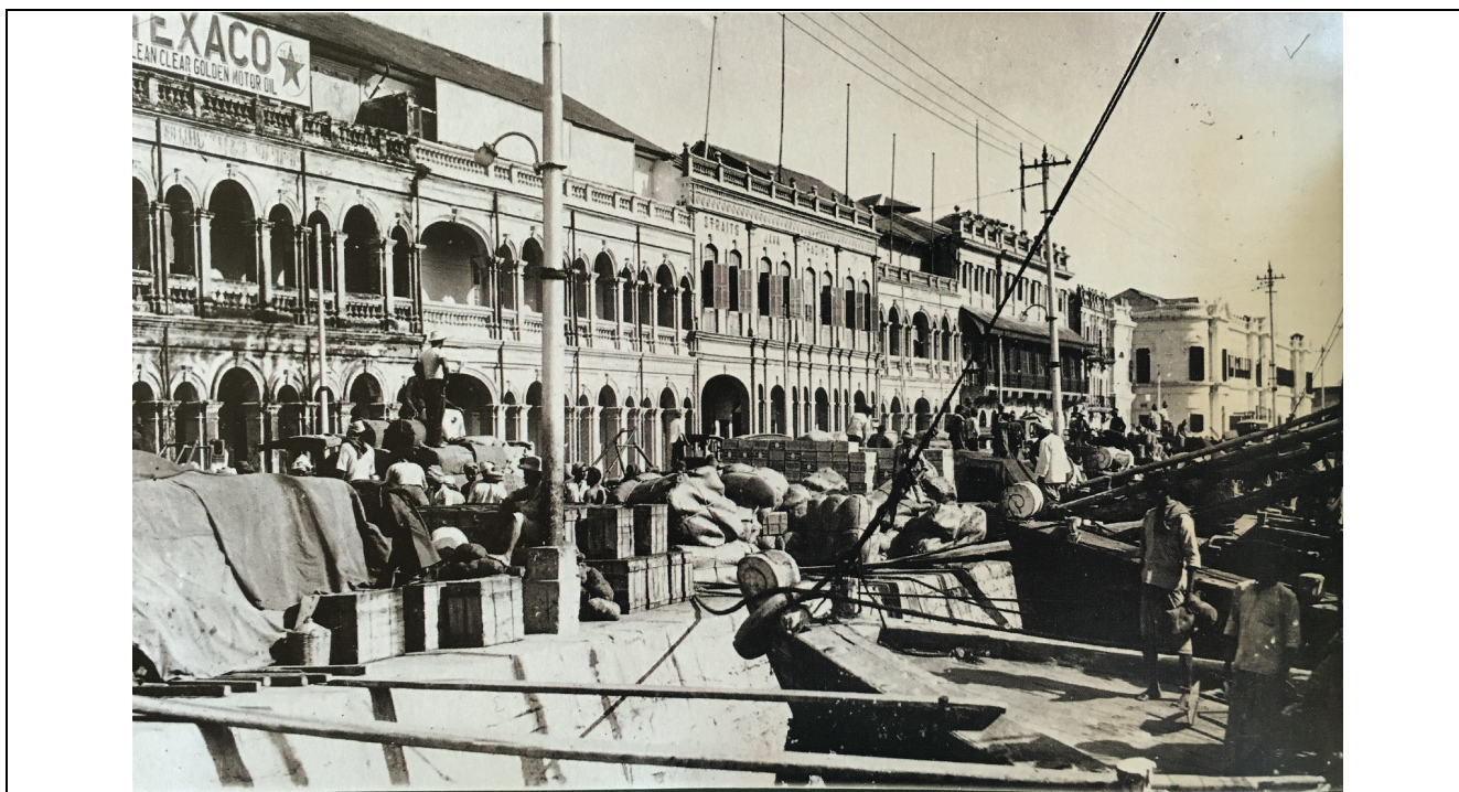
Figure 2. Environment setting of Weld Quay in the early of twentieth century.