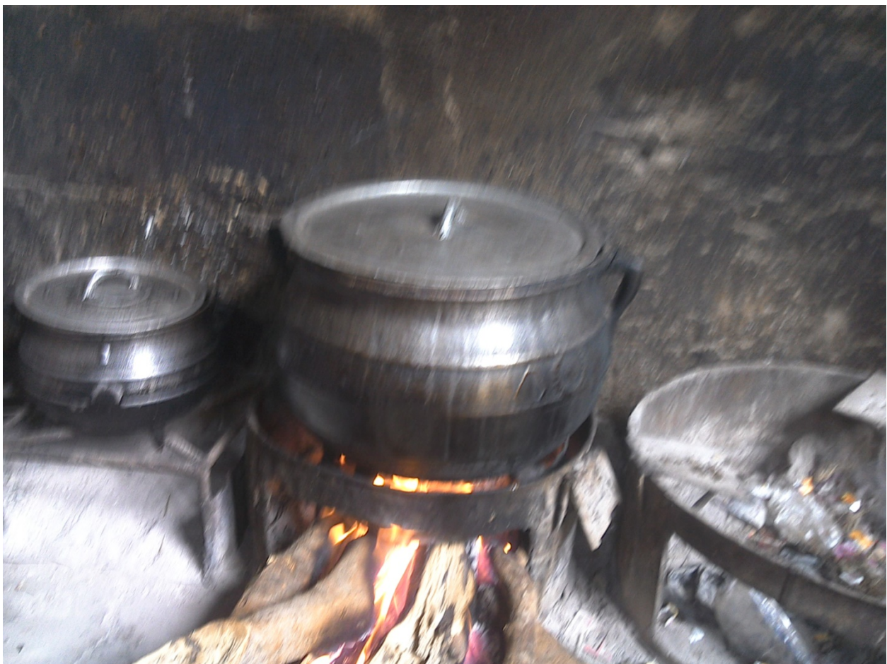
Fuelwood in action

Furthermore, access to woodfuels means having physical access to the source, the right to gather woodfuels from that source and having the necessary field labour available to collect and transport it. Such field labour is usually supplied by women and children in other part of the world but the story is different here at Gombe were the male dominate the business. It is the most available forms of energy that you can get free from natural forest reserves.