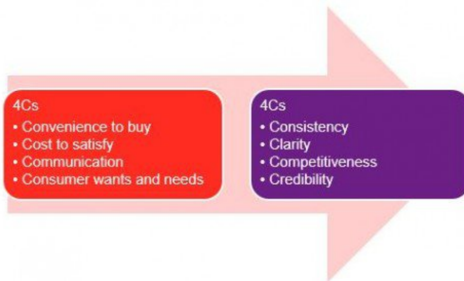
Figure: 4C's Marketing Model

"The 4Cs for marketing communications: Clarity; Credibility; Consistency and Competitiveness (Jobber and Fahy, 2009)"