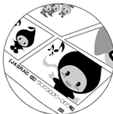
Fig. 2. JASRAC number when posting lyrics in cartoon

This is the responsibility and duty at the same time for the organization, JASRAC must have. Since JASRAC is entrusted rights from the original creators, it is important to put best efforts to protect their rights and compensation. However, these activities have been controversial in music market. JASRAC started to gradually expand royalty collection targets according to performance rights of music organizations since 2003; Physical Education facilities in 2011, cultural center in 2012, dance academies in 2015 and singing classes starting from 2016. In February 2017, JASRAC announced to collect royalty from music classes starting from 2018. As a reaction to this, music education organizations centering on 'YAMAHA Music Class' created 'protecting music education organization' and started to spreading opposition movement from the royalty collection. They claim that it is not appropriate to collect royalty from music usage in music classes not in recital or performance. However, according to the current Law, JASRAC's claim is not considered as illegal. Composition is also a creation so it needs creator's permission to play or duplicate the song. If the creator chose trust service like JASRAC to protect his/her right, JASRAC can provide or prohibit the access about the song. However, it is stated like followings in Japan copyright law Article 22 [4]: