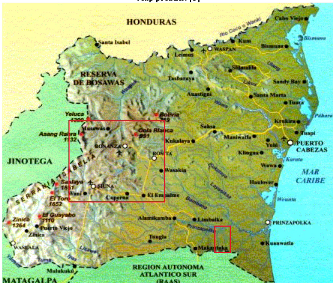
Figure 1 Map pf RAAN [3]

Law 28 of Nicaragua recognized the autonomy of the RAAN to the north and the Autonomous Atlantic Region of the South (RAAS) in 1987. The real power came to the Indigenous and Afro