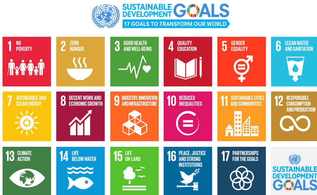
Figure 2 UNESCO Goals 2030 [5]

The authors looked at these goals in comparison to the PowerPoint slide show provided by the leaders of SauniAs and with the experience of visits and the knowledge of the Anthropologist on the team.